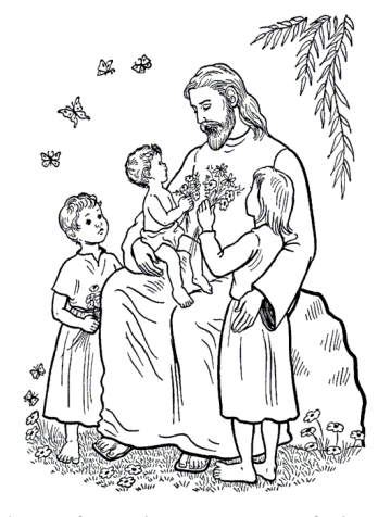
Third Sunday after the Octave of the Theophany Գ Կիրակի զկնի Ծննդեան Ութօրեքին

Armenian Historical Year 4509 (SCO) -Armenian Calendrical Year 1466 (Ωυ42)