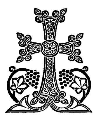
Prepared by St. James Armenian Church of Evanston, IL