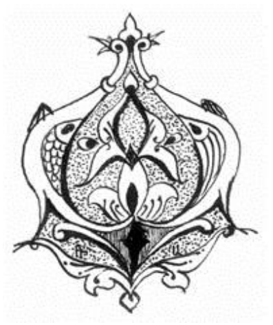
Armenian Historical Year 4505 (SCb) Armenian Calendrical Year 1461(NbyU)